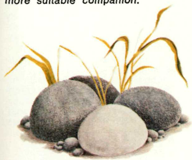
A pack of wild rocks.

show practically no learning abilities whatsoever. There's an old saying in rock circles, "Once a wild rock, always a wild rock." A genuine, pedigreed PET ROCK will make a much more suitable companion.