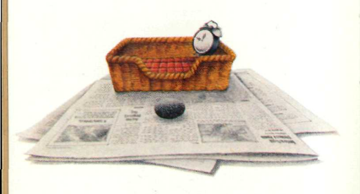
A place of its own.

If, when you remove the rock from its box it appears to be excited, place it on some old newspapers. The rock will know what the paper is for and will require no further instruction. It will remain on the paper until you remove it.