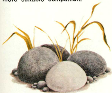
A pack of wild rocks.

show practically no learning abilities whatsoever. There's an old saying in rock circles, "Once a wild rock, always a wild rock." A genuine, pedigreed PET ROCK will make a much more suitable companion.