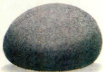
Performing its first trick.

You will tire of this trick long before your PET ROCK does.