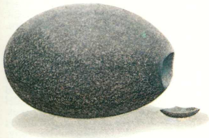
A chip off an old rock.

If your PET ROCK appears nervous and fidgety, it's a better than even chance it's suffering from dreaded Rock Bottom. No other disease is as debilitating to PET ROCKS as Rock Bottom. The first symptoms are mani-