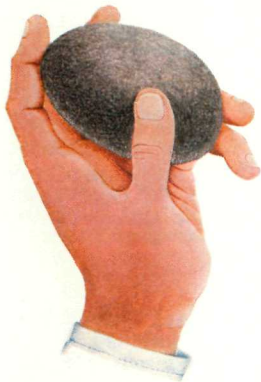
A pet rock poised for the attack.

prise enters into this attack method, thereby making it doubly effective.